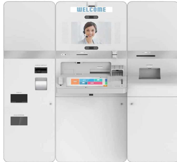
I60X/XL - A+B+C