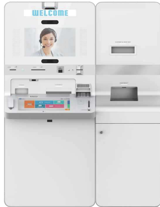
I60X/XL - A+B